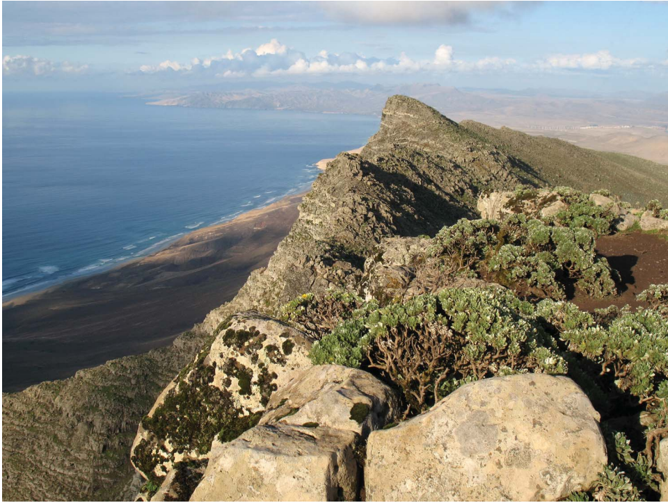
Figure 3. Asteriscus sericeus growing in the habitat of Tarphius jandiensis n. sp. at Pico de la Zarza, island of Fuerteventura.