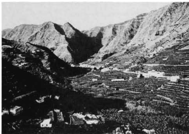
Fig. 2. The cultivated areas in the intermediate zones of some islands may represent a habitat expansion for thermophilic reptiles.

systems, and they may even increase, as sometimes occurs with other groups of vertebrates (v. habitat expansion in birds, Vølse 1955). Nevertheless, some special cases are worth mentioning.