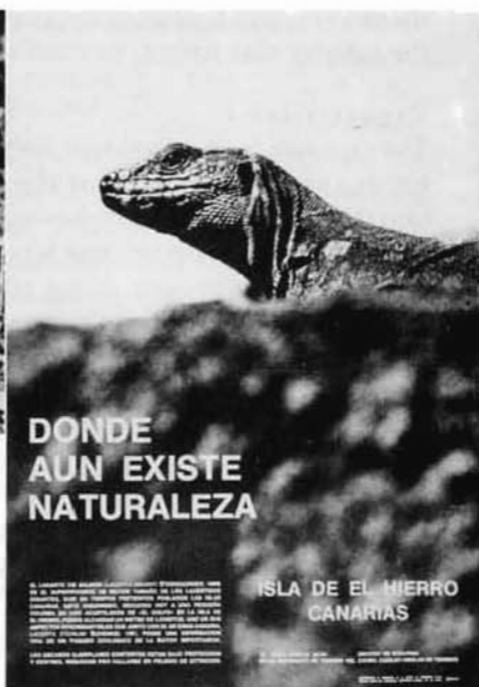
Fig. 4. Conservation poster (40 x 30 cm), produced by the Union of Insular Councils. Its message means "El Hierro, where there still is Nature". In smaller text information on the status of Gallotia simonyi and its importance to science is given.

importance of predation by the latter mentioned species is low on small reptiles but, as postulated by Machado (1985), could have been the reason for the decline of the large lizards. Fortunately, snakes have not been introduced into the archipelago. If this was the case, considerable impact on reptiles by competition and/or predation would be expected. Competition between goats and rabbits with herbivorous reptiles is of importance only at specific sites.