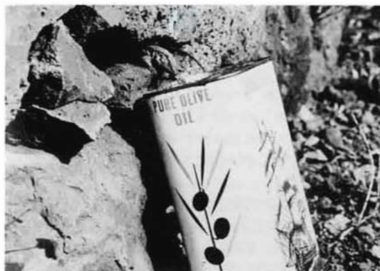
Fig. 3. Tin cans used as lizard traps to control populations in cultivated fields.