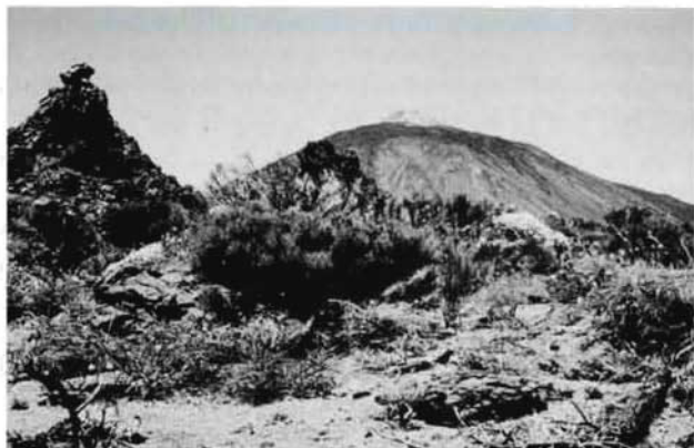
Fig. 5. Habitat of Gallotia galloti eisentrauti , a common species in Teide National Park.

altitude with 511 hectares of laurisilva and pine forest; property of ICONA; one permanent ranger in the field. Lizards scarce, only in upper parts.