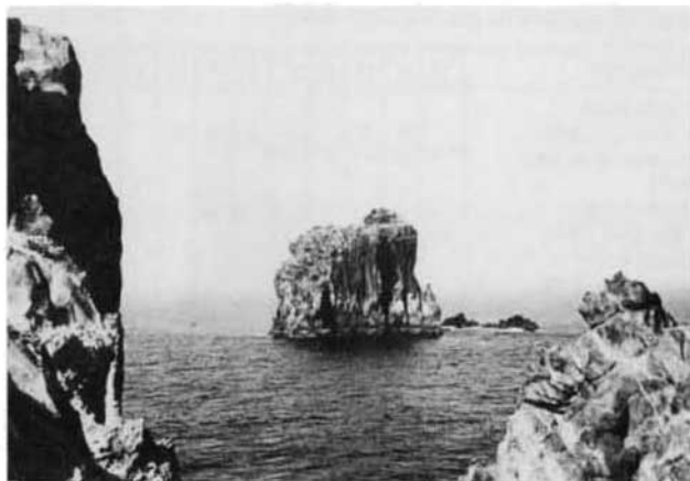
Fig. 1. The "Roque Chico" of Salmor (El Hierro), type locality of the now extinct Gallotia simonyi .

The Lizard of Salmor, G. simonyi (Steind.), is extinct as confirmed during August 1984. A further record of G. simonyi on the Roque de Fuera (Anaga, Tenerife) given by Báez & Bravo (1983) is probably an error (Martín 1985).